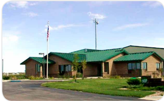
Wall, SD Office

1200 W Fourth Ave PO Box 412 Wall, SD 57790 Phone: 605/279-2135 Fax: 605/279-2630