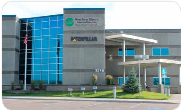
Rapid City Office

3250 E Hwy 44 PO Box 3486 Rapid City, SD 57709 Phone: 605/393-1500 Fax: 605/393-0275