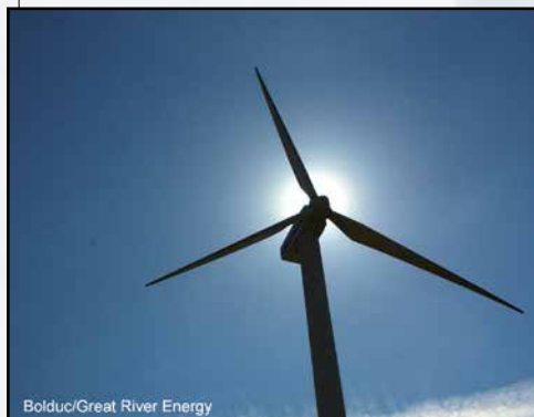
Bolduc/Great River Energy