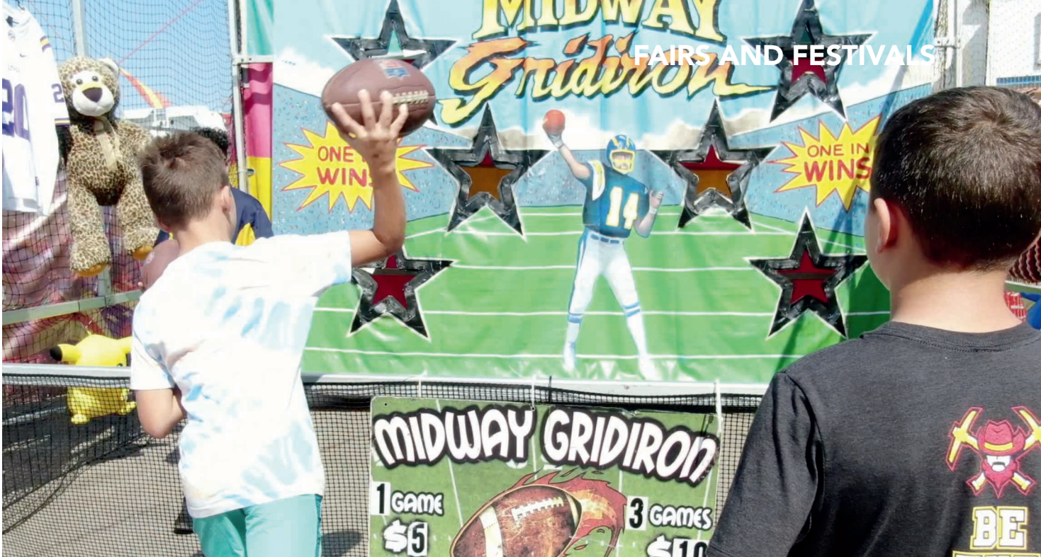
Fairs and festivals offer opportunities for fun, education and games to test your skills.

are annual attractions throughout the summer and fall.