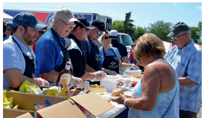
Electric cooperatives are involved in making sure local events are fun for everyone.