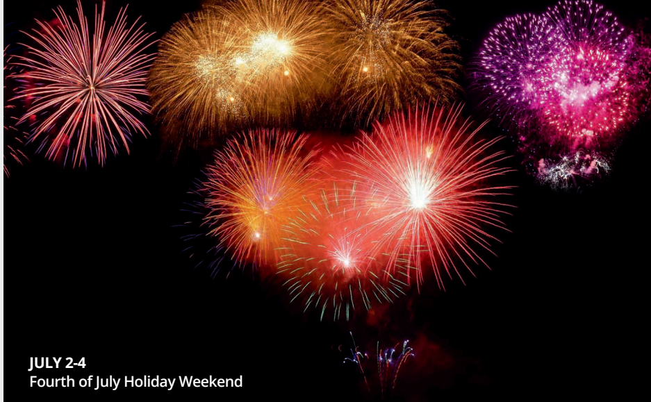
JULY 2-4 Fourth of July Holiday Weekend

To have your event listed on this page, send complete information, including date, event, place and contact to your local electric cooperative. Include your name, address and daytime telephone number. Information must be submitted at least eight weeks prior to your event. Please call ahead to confirm date, time and location of event.