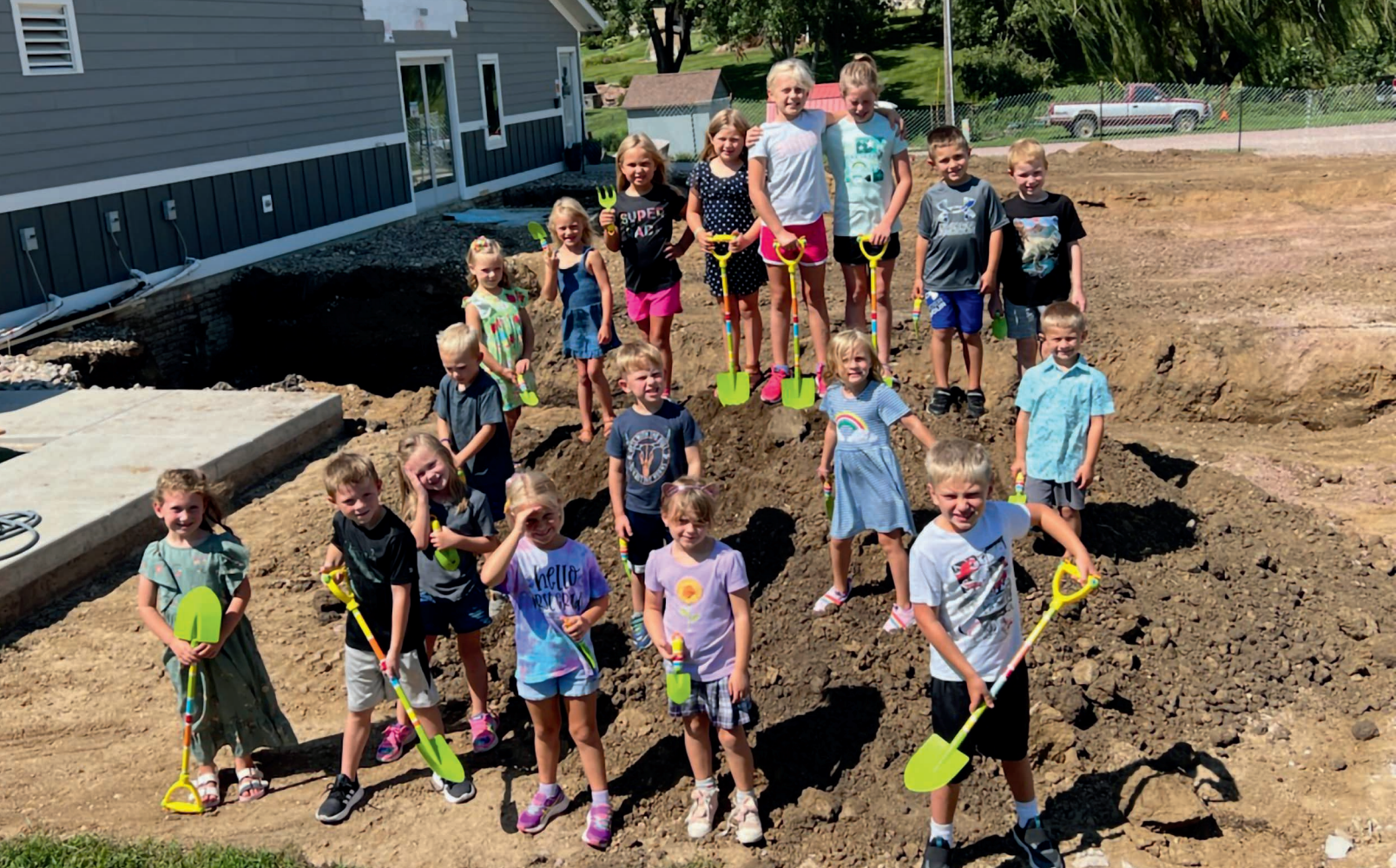
Garretson Childcare helpers are getting ready to help grow their daycare.