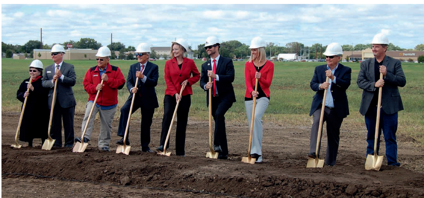
Participants celebrate the groundbreaking for the National Music Museum in Vermillion.

All of these impacts occur in counties where electric cooperatives operate, showcasing the substantial local economic benefits that co-ops provide in the communities they serve.